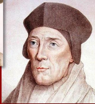
St. John Fisher

The fearless witness of Saint Thomas More and Saint John Fisher is especially compelling to American Catholics today, as we face threats to our religious liberty and rights of conscience. The relic tour is part of the broader Fortnight for Freedom. Come to learn more about the lives of these saints, ask for their prayers, and be inspired by their example.